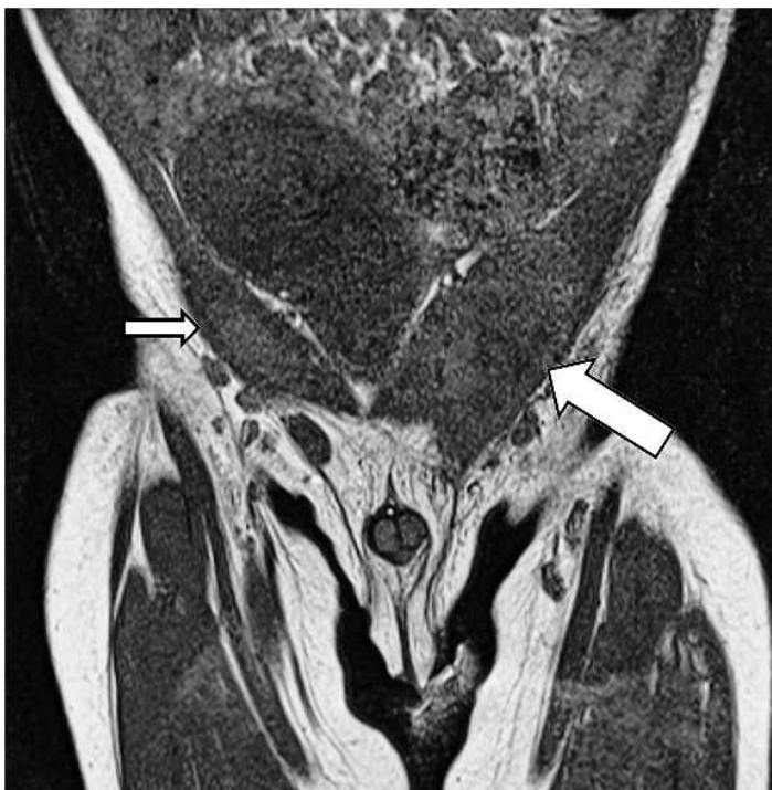
Figure 2. This coronal T1 weighted magnetic resonance image of the patient demonstrates a normal homogenous right undescended testicle (small arrow) and a heterogeneous inflamed left undescended testicle (large arrow).