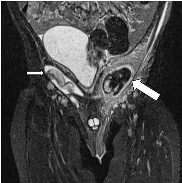
Figure 1. This coronal T2 weighted magnetic resonance image of the patient demonstrates a normal homogenous right undescended testicle (small arrow) and a heterogeneous inflamed left undescended testicle (large arrow).