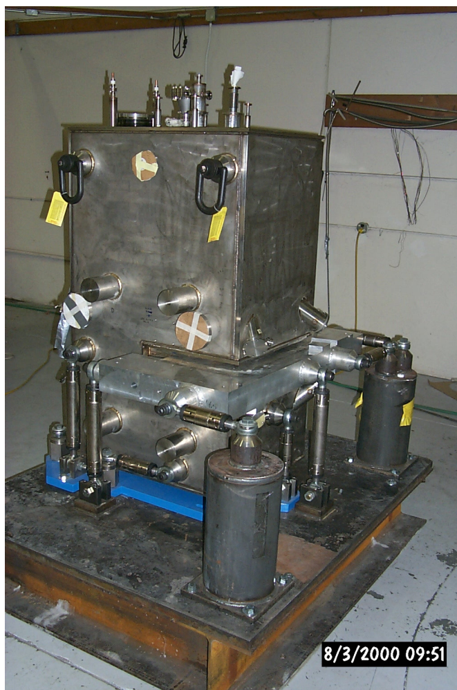
Fig. 1 Magnet #1 installed on the test stand.

Figure 1 below, shows a picture of Superbend #1 installed around an alignment fixture on the test stand. Both the cryostat and the alignment fixture are mounted with six struts allowing for adjustment in all degrees of freedom.