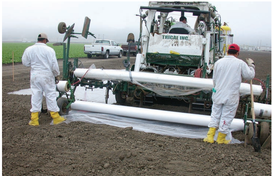
The fumigant methyl bromide — which is being phased out due to its impacts on the ozone layer — was used as a standard for the control of soilborne pests and diseases in all the nurseries and fruiting fields in this study. Above, methyl bromide is applied in a fruiting field near Watsonville.

University of California researchers Larson and Shaw (2000) evaluated alternative fumigant treatments in low- and high-elevation nurseries to measure the effects on runner-plant production. However, until we began this project, no comprehensive studies had been con-