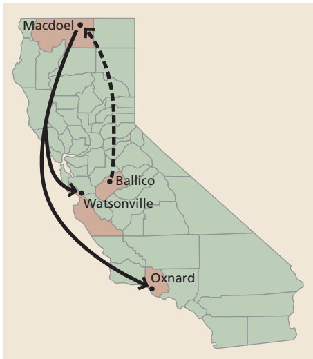
Fig. 1. Nursery production evaluations were conducted at a low-elevation site at Ballico. Harvested runner plants were then transported to Macdoel for use in the high-elevation experiment. Fruit evaluations were conducted on the coast at Watsonville and Oxnard.

ducted in strawberry nursery and fruit production systems to evaluate the effects of alternative fumigants on disease, nematode and weed control. We monitored the movement of plants through the system, allowing inferences to be made about the cumulative effects of fumigation. In addition, we gathered and evaluated information on the economics of production for each treatment. To our knowledge iodomethane has never before been evaluated in California strawberry nurseries. More detailed methods and results are published elsewhere (Kabir et al. 2005).