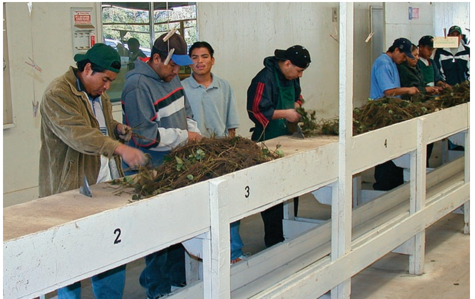
At Lassen Canyon's trim shed in Redding, workers sort strawberry plants harvested the previous day from high-elevation nursery fields. The workers separate healthy, marketable plants, trim them and then pack them for shipment to fruiting fields on the California coast.

At Macdoel, the treatments evaluated were: (1) equal amounts of iodomethane and chloropicrin at 350 pounds per acre; (2) methyl bromide plus chloropicrin at 400 pounds per acre (57% MB + 43% CP); (3) chloropi-