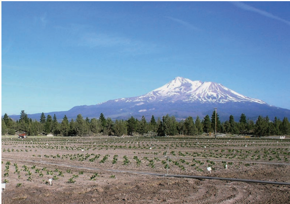
California strawberry runner plants are propagated in high-elevation nurseries such as this one near Macdoel, north of Mt. Shasta. The harvested runner plants are transported to fruiting fields in California or exported to other states or countries.

Methyl bromide (MB) is a fumigant that is applied to the soil before planting to provide season-long control of soilborne pathogens, insects, nematodes and weeds. Several vegetable, fruit and perennial crops rely on methyl bromide for pest control (USDA ERS 2000). In the United States, tomatoes, strawberries and peppers account for most of the methyl bromide used in soil fumigation (30%, 19% and 14%, respectively) (Carpenter et al. 2000). Other crops that use methyl bromide include almonds,