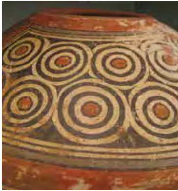
The pattern on the inside covers was inspired by the geometric designs on this Gran Coclé vessel (22/8375).