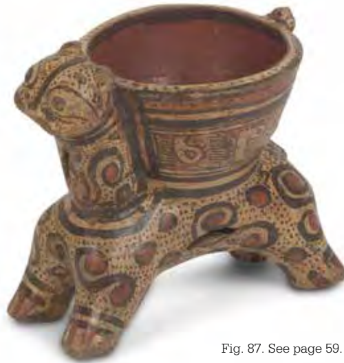
Fig. 87. See page 59.

Guevara, Marcos. 2009–10. "Sobre el valor pragmático del mito. Apuntes desde la mitología comparada de Talamancas y Kunas." Anuario de Estudios Centroamericanos . Universidad de Costa Rica 35 (26):11–35.