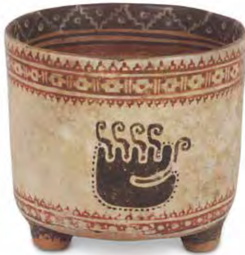
Fig. 52. See page 36.

Figure 11. Central Caribbean/Costa Rican Atlantic Watershed bowl, AD 800–1500 Las Mercedes, Limón Province, Costa Rica Pottery Collected or excavated by Alanson B. Skinner, 1916–1917. 18 × 16 × 12 cm (7/4335).