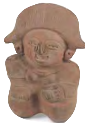
Ulúa River female figure, AD 250–900. Río Ulúa valley, Honduras. Pottery. Formerly in the collection of Marco Aurelio Soto; MAI purchase from an unknown source, 1917.