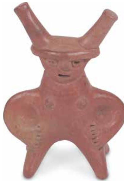
Fig. 19. Central Caribbean/ Costa Rican Atlantic Watershed female figure, 300 BC–AD 300. Bolsón, Guanacaste Province, Costa Rica. Pottery, clay slip. MAI purchase from Wanda B. Scheifele, 1964.