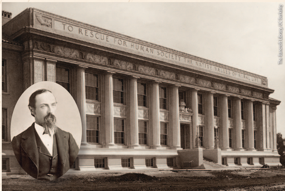
Eugene W. Hilgard, a German-American soil scientist, became professor and director of the Agricultural Experiment Station in 1875. During his 30-year tenure, Hilgard established UC as a respected center of agricultural research and guided the college to transfer knowledge statewide via field stations and farmer institutes. Hilgard Hall, dedicated in 1917, currently houses the College of Natural Resources at UC Berkeley.

One article details the impressive yield increases for corn and tomatoes achieved during an 11-year field study of conservation tillage (see page 55). This cultivation method, which forgoes tilling and leaves residue from the previous crop on the ground, has the