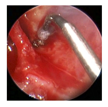
FIG.2. The use of the curved laser in the sinus tympani (right ear) to ablate cholesteatoma as visualized with a 30-degree, 2.6-mm rigid otoendoscope.

Total is greater than 7 as cholesteatoma may have been found in multiple locations.