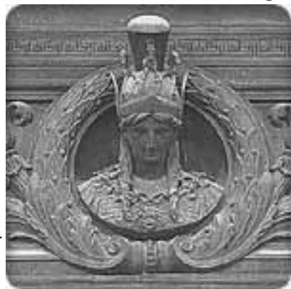
Bust of Athena, Doe Library at the University of California, Berkeley

The Oak Ridge laboratory, now called Oak Ridge National Laboratory (ORNL), was less military-oriented after the war, but like the LANL, its research has also